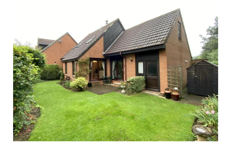
Central heated and double glazed, the accommodation in further detail comprises :-

Built approximately 33 years ago to an individual design and specification for the current owner and now offered for sale on the market. Enjoying an ideal location for easy access to the nearby schools of Crossley Street and St Josephs, together with access onto the Harland Way and other walks, literally on the door step. There are three reception rooms on the ground floor and on the first floor three double bedrooms with the option of a fourth double bedroom, dressing room or study, with potential for an en suite.