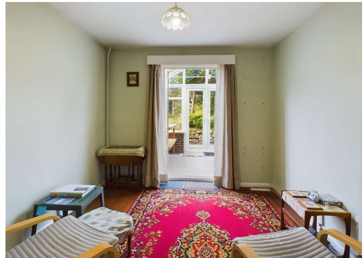
Belfield Road, Pembury, Tunbridge Wells, Kent, TN2 4HL