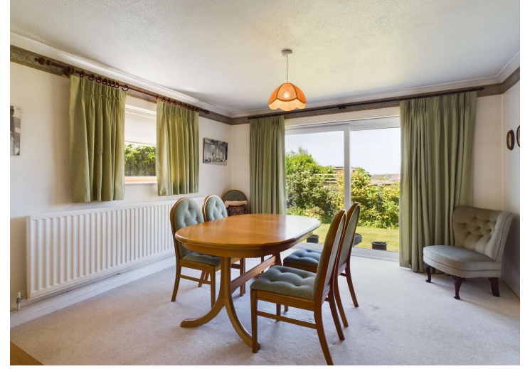
The Gill, Pembury, Tunbridge Wells, Kent, TN2 4DL