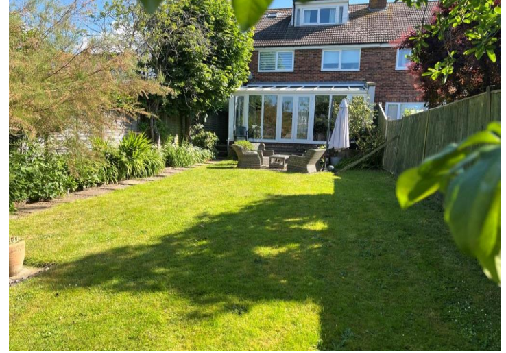
Tonbridge Road, Hildenborough, Tonbridge, Kent, TN11 9BH