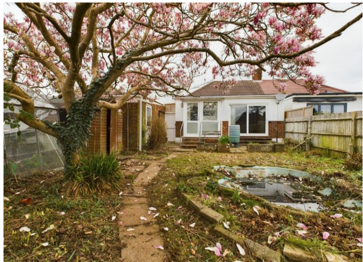
Colin Blythe Road, Tonbridge, Kent, TN10 4LD