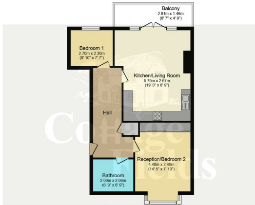
Floor Plan Floor area 68.4 m 2 (737 sq.ft.)