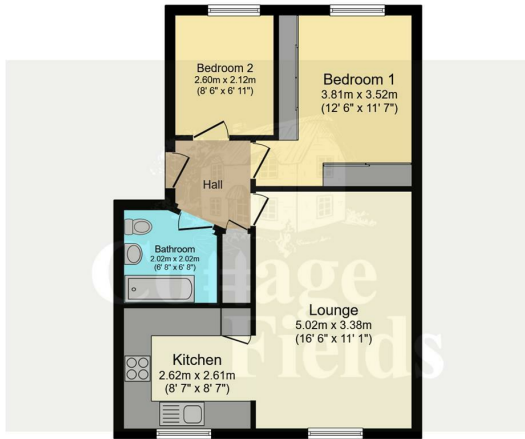
Floor Plan Floor area 50.9 m 2 (548 sq.ft.)