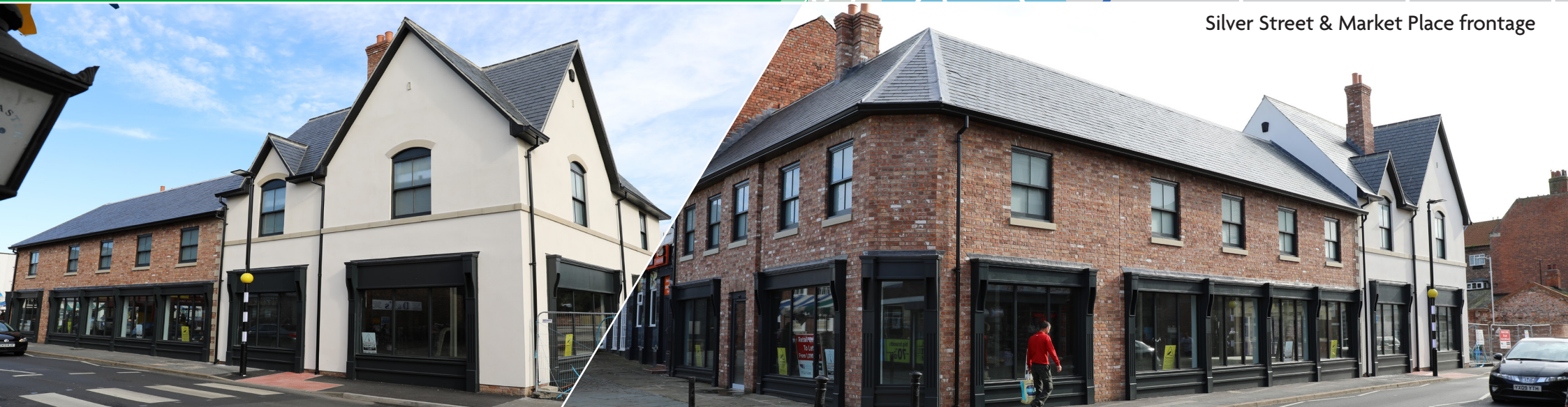
Silver Street & Market Place frontage

Misrepresentation Act: These particulars are produced in good faith and believed to be correct. Neither FitzGerald Property Consultants, Barnsdales or their client guarantees their accuracy and they are not intended to form any part of a contract. No person in the employment of FitzGerald Property Consultants or Barnsdales has authority to give any representation or warranty in respect of this property. These particulars were produced in August 2021.