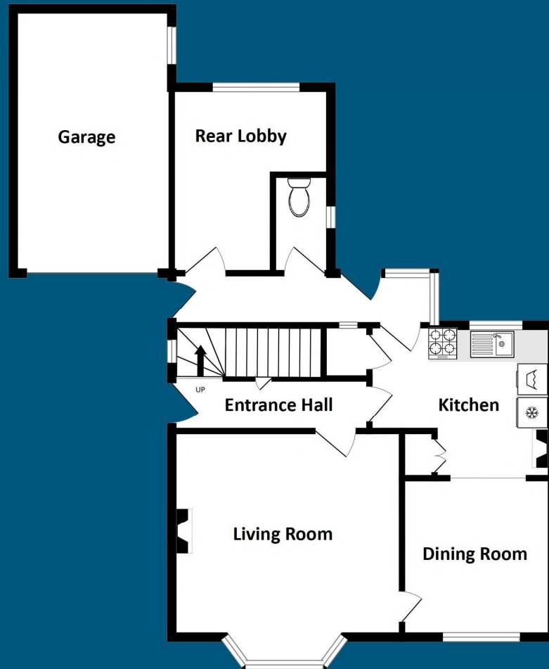
Ground Floor Approx.: 797sq feet (74.0 sq metres)

Total Floor Area Approx.: 1270sq feet (118.0 sq metres)