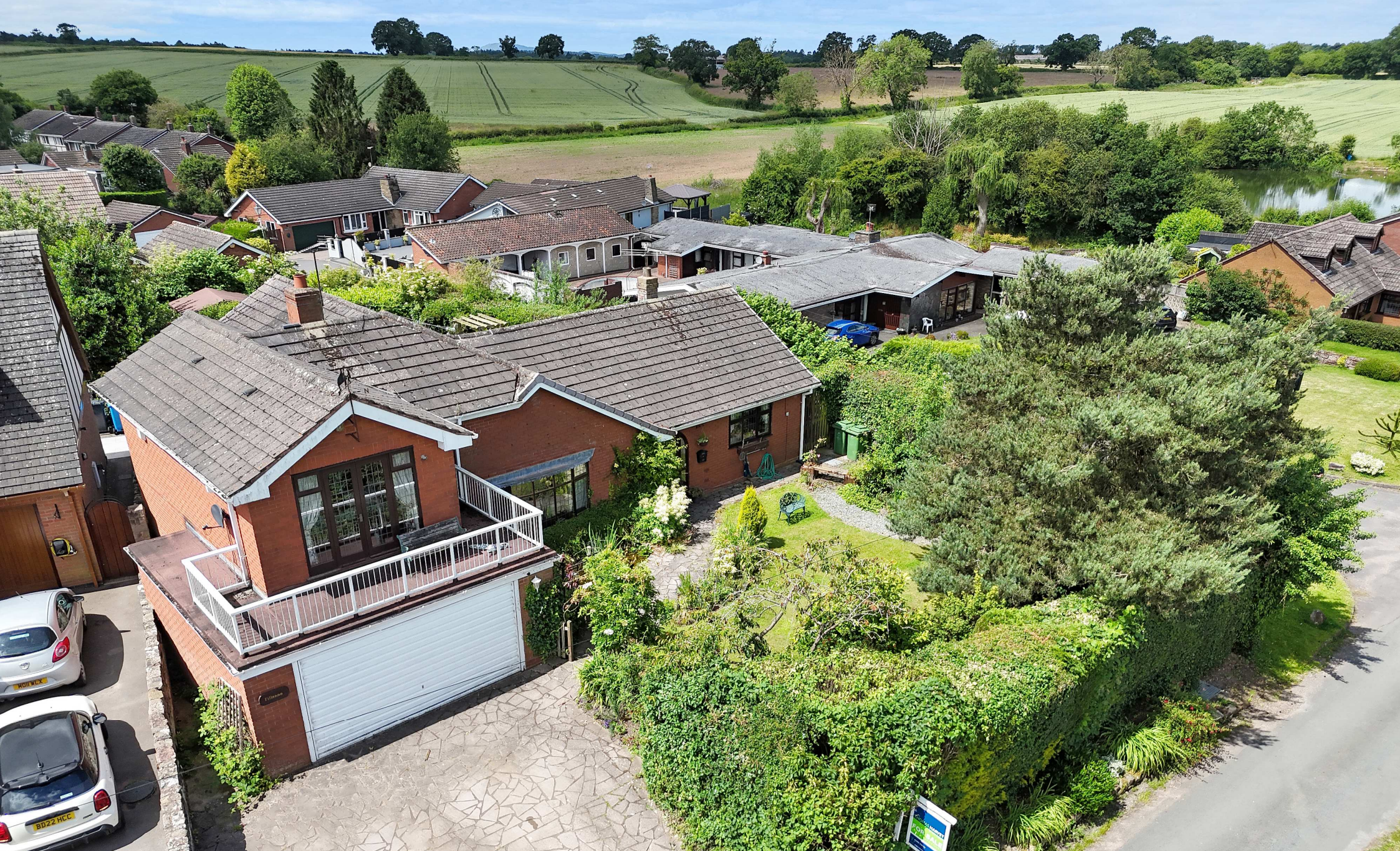
Filanne, Spring Lane, Bishops Wood