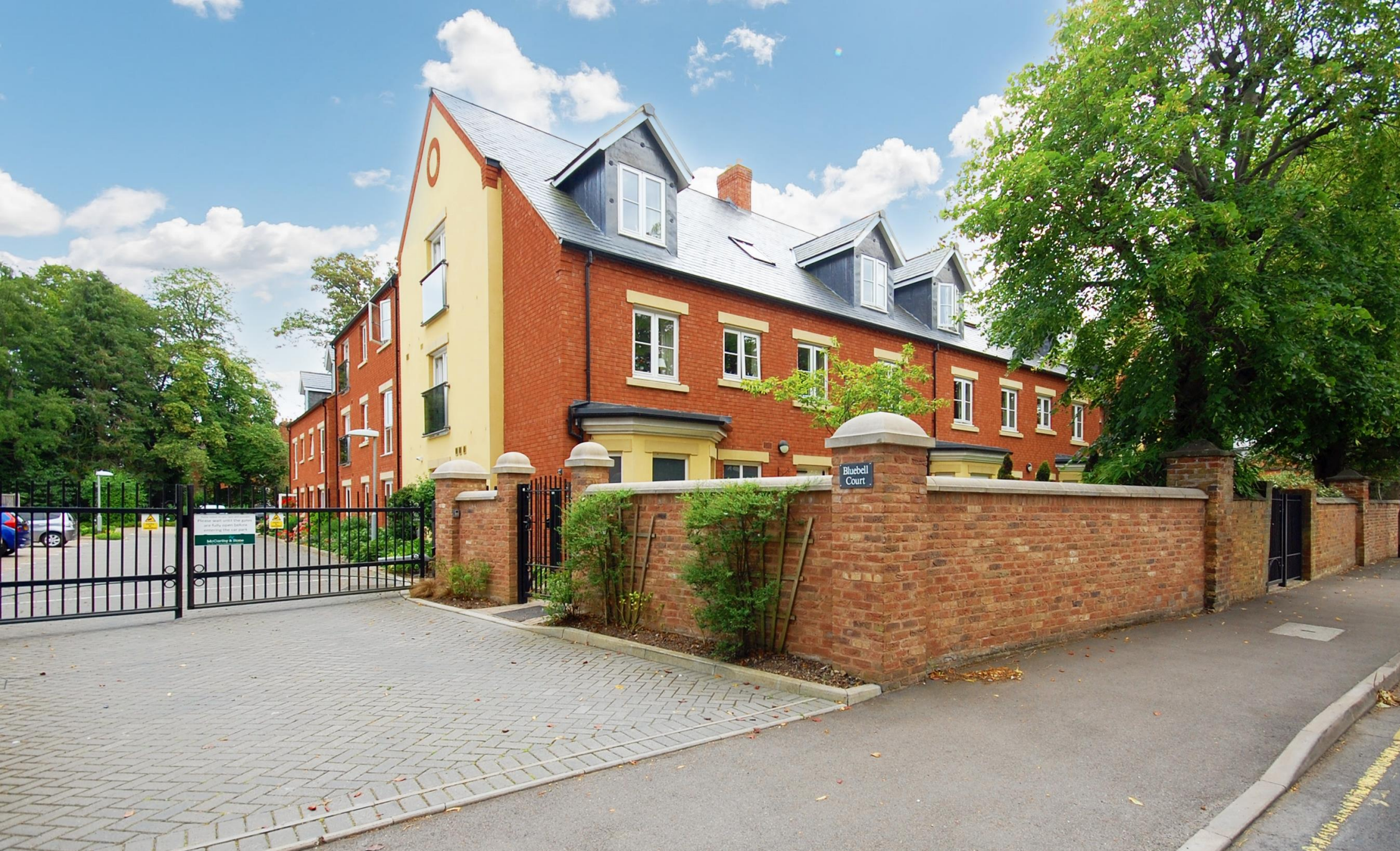
Flat 18 Bluebell Court, Tettenhall