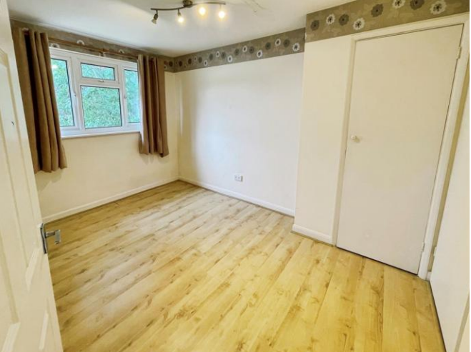
BEDROOM ONE 13' 1" x 9' 0" (4.01m x 2.74m) Front aspect window, wardrobe, storage cupboard, radiator and laminate floor.