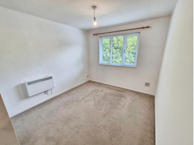
BEDROOM 12' 3" x 9' 4" (3.74m x 2.86m) Rear aspect window, carpet, electric radiator, double wardrobe and airing cupboard.