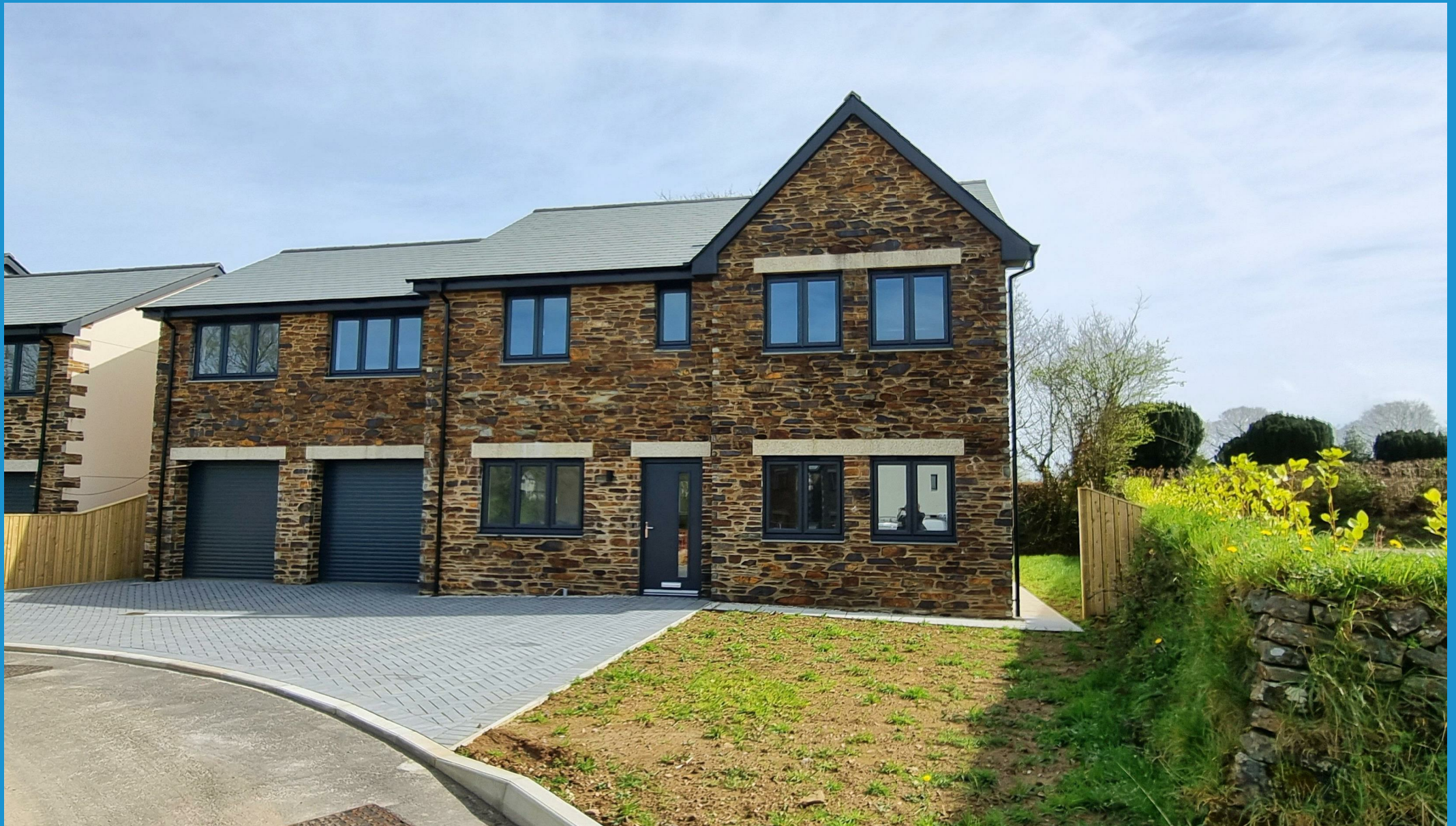
Plot 2 Tresmarrow Launceston | Cornwall