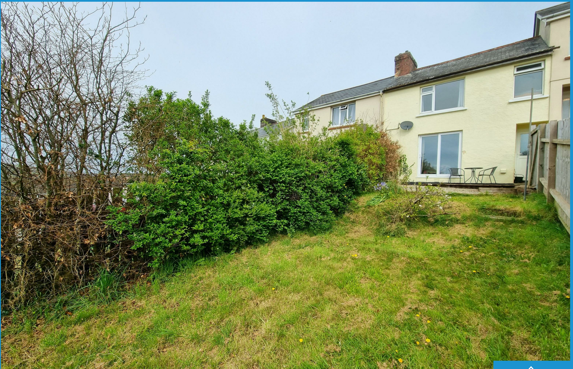
6 Dutson Terrace Launceston | Cornwall