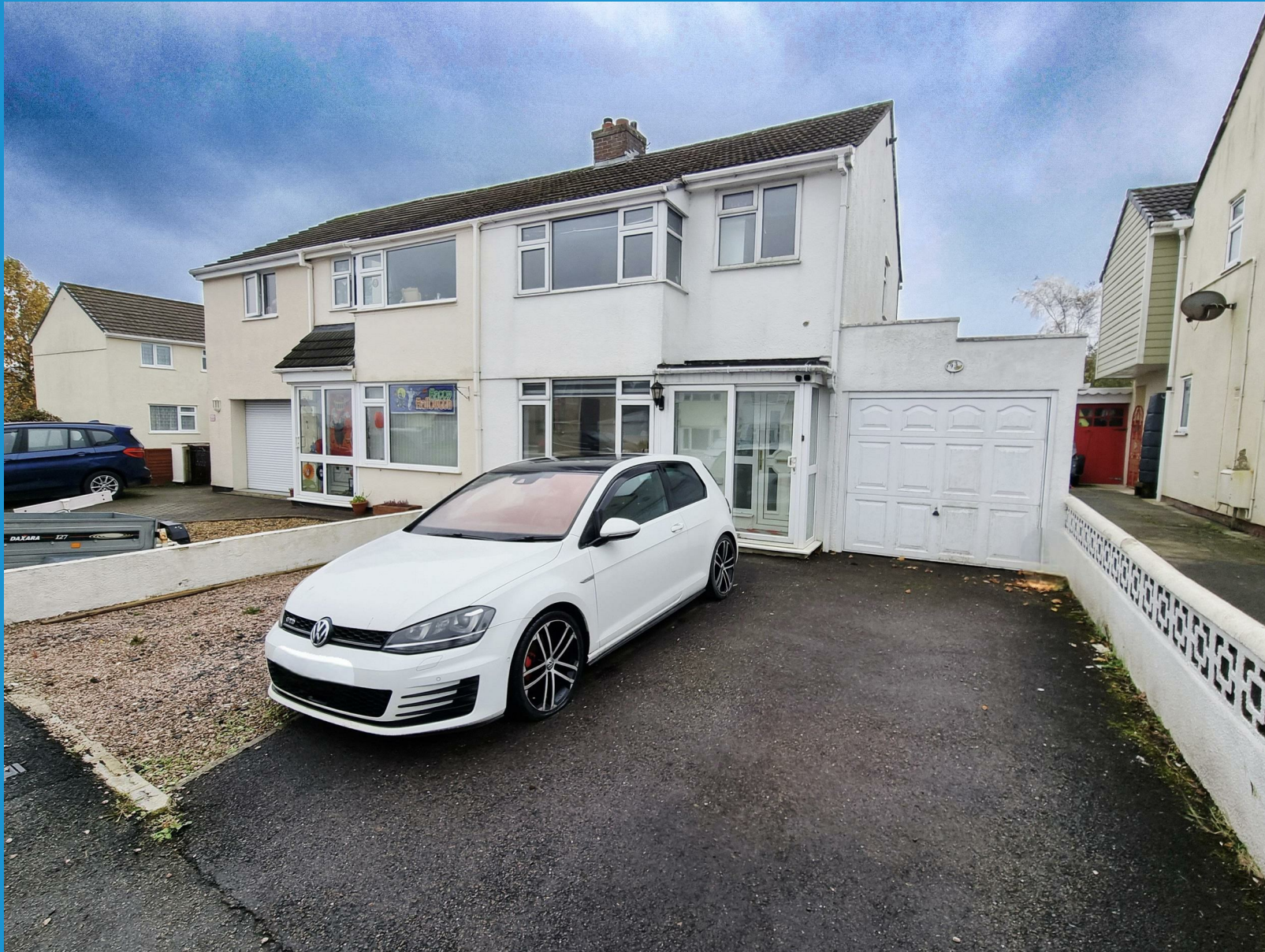
St. Johns Road Launceston | Cornwall