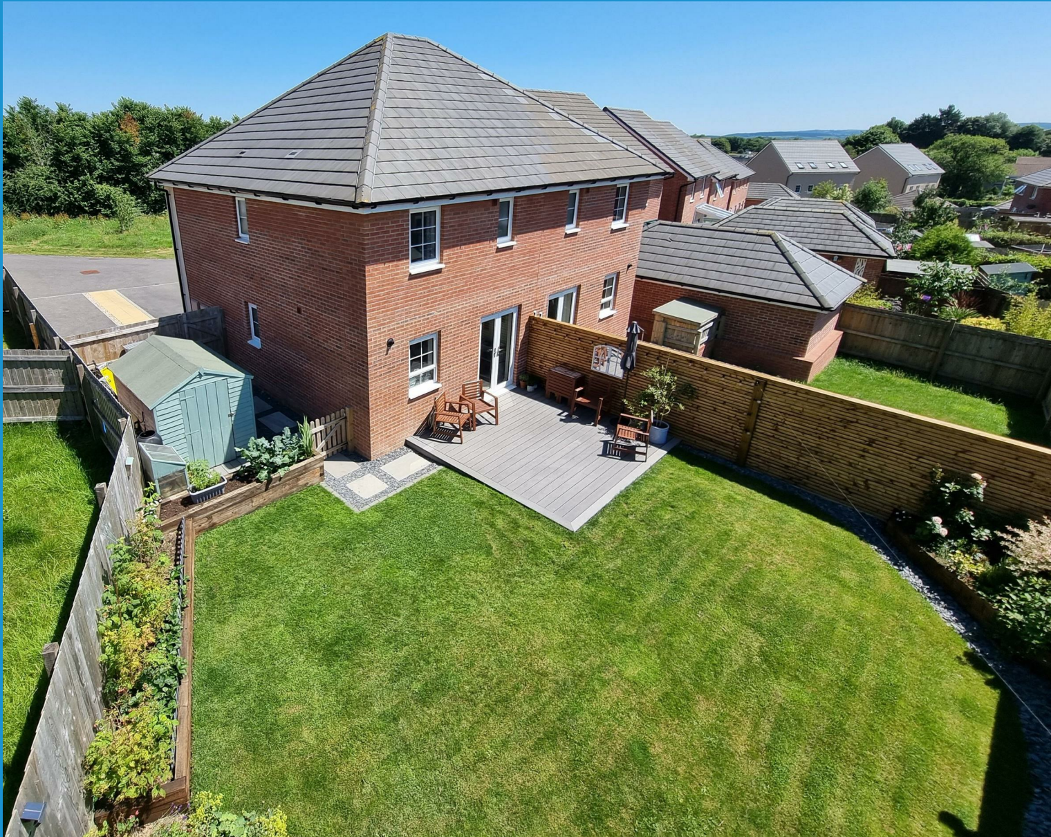
Grammers Park Launceston | Cornwall