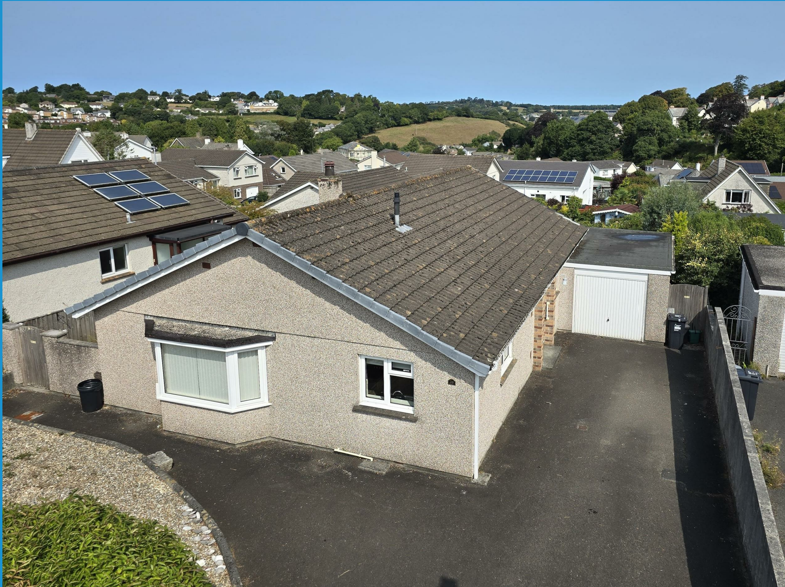
Dunheved Fields Launceston | Cornwall