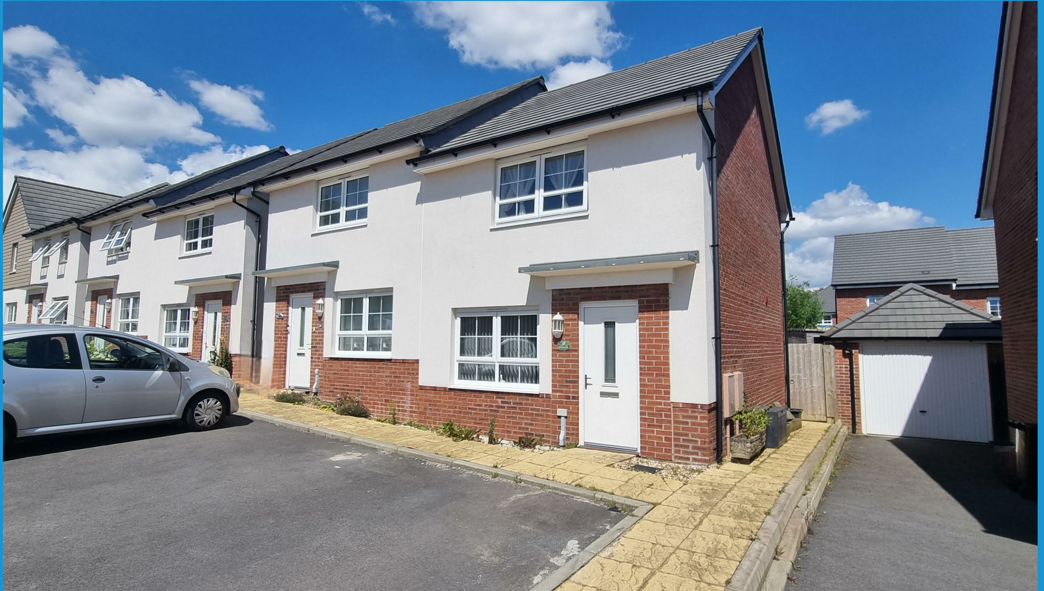
18 Grammers Park Launceston | Cornwall