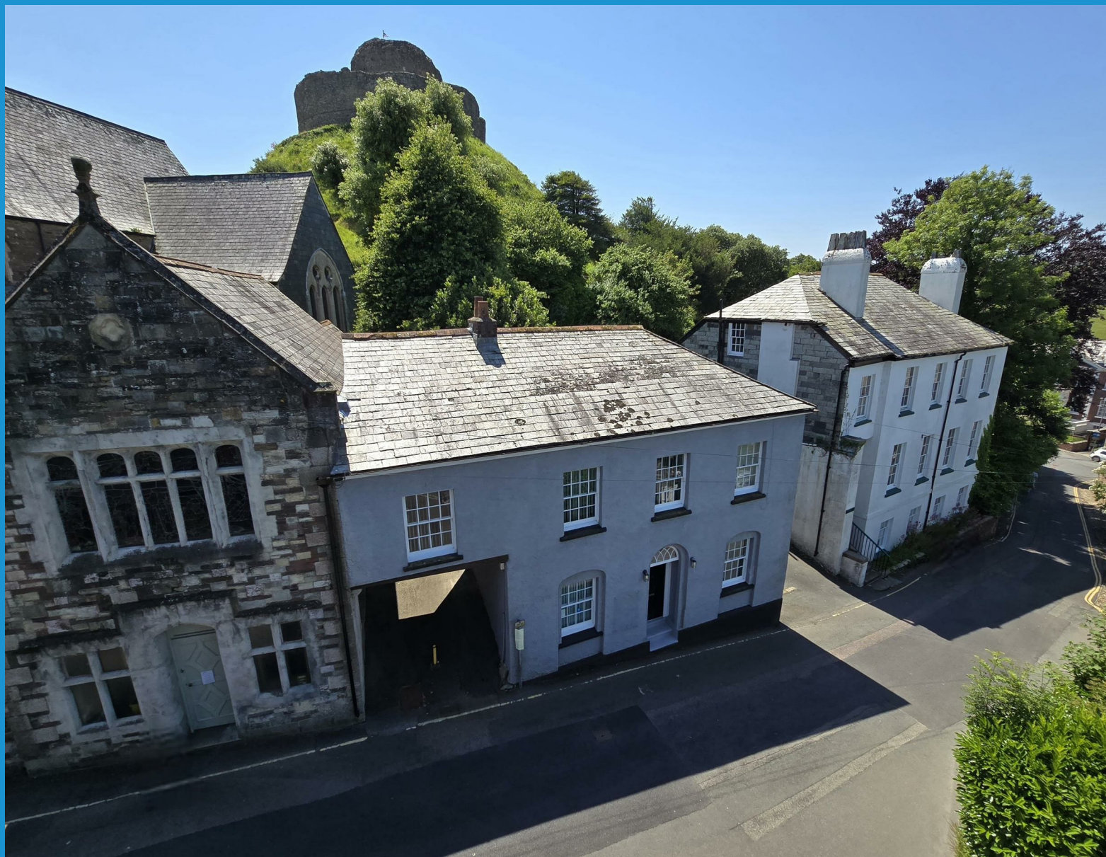
Castle Street Launceston | Cornwall