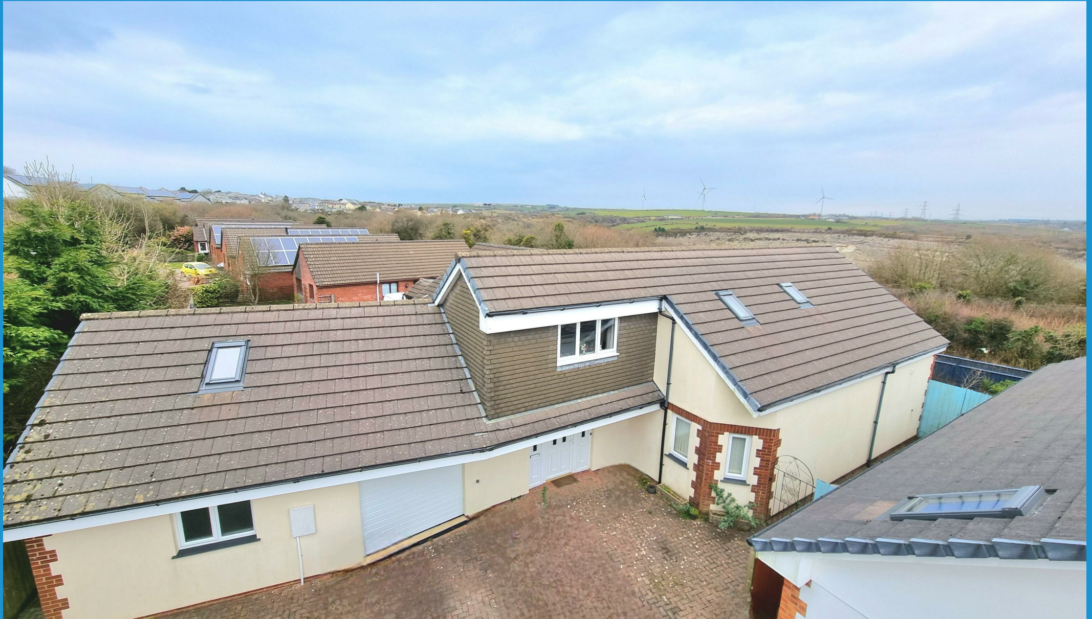
The Sidings | Delabole |