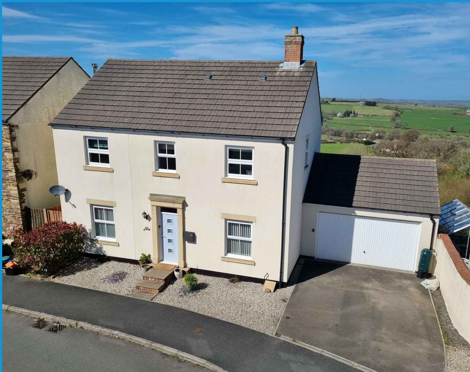
Snowdrop Crescent Launceston | Cornwall