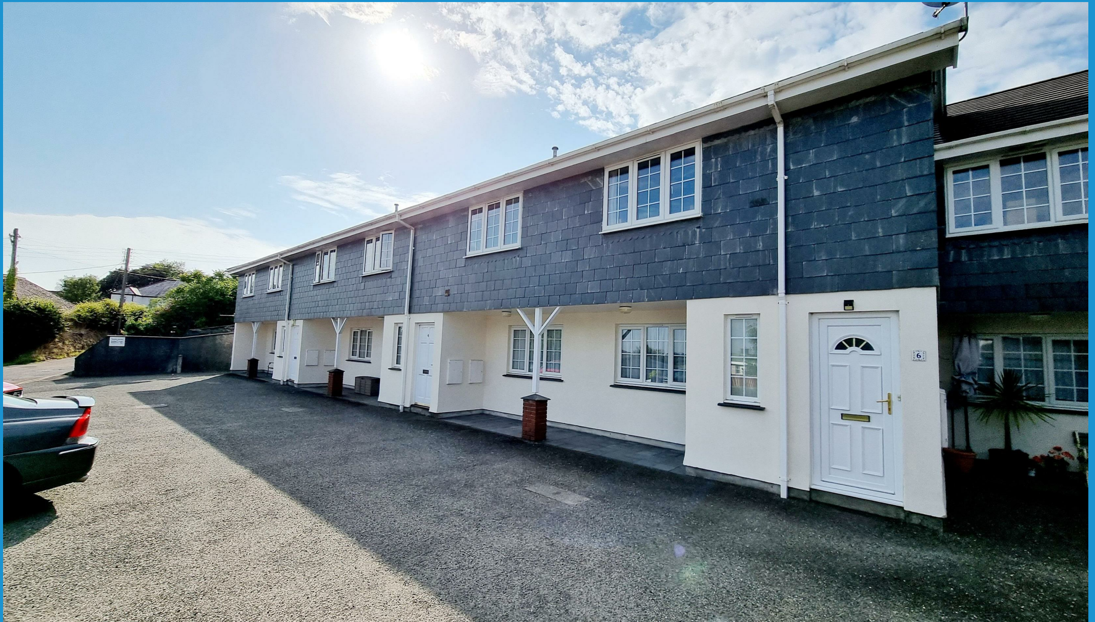
6 Bounsalls Court, Bounsalls Lane Launceston | Cornwall