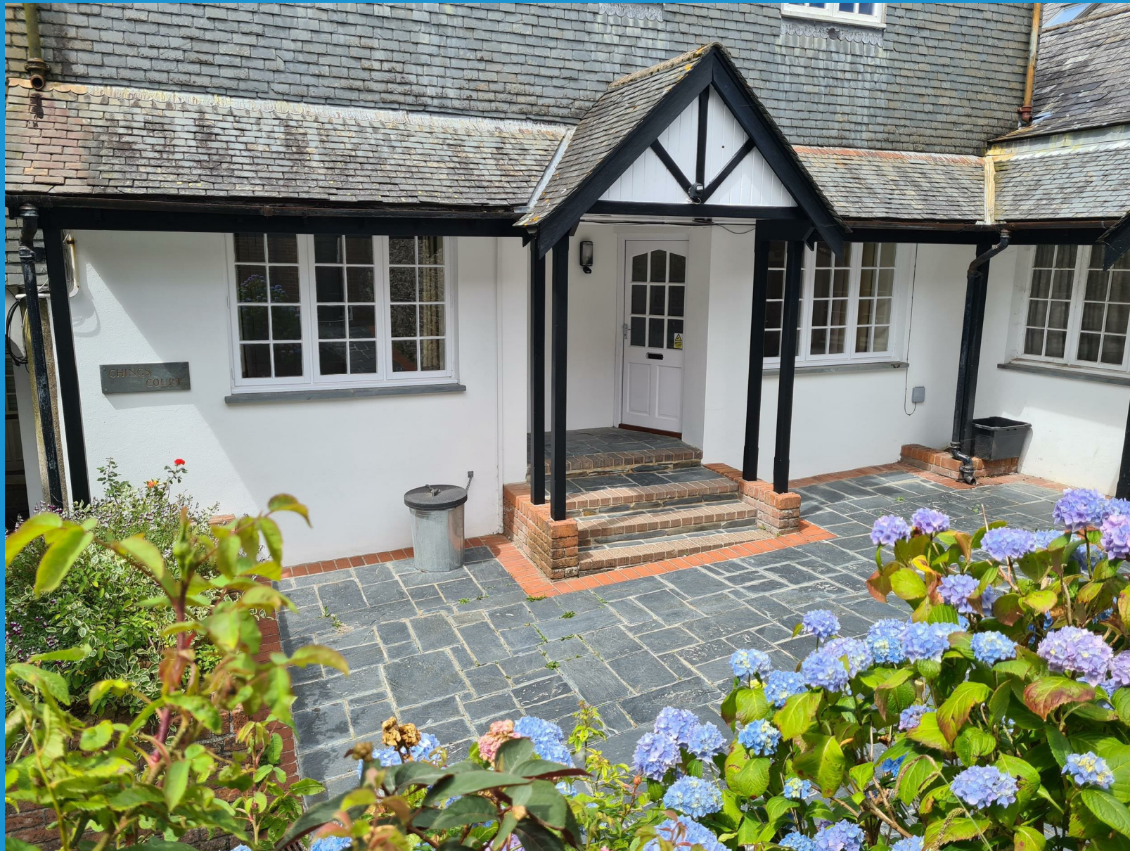
Chings Court Launceston | Cornwall