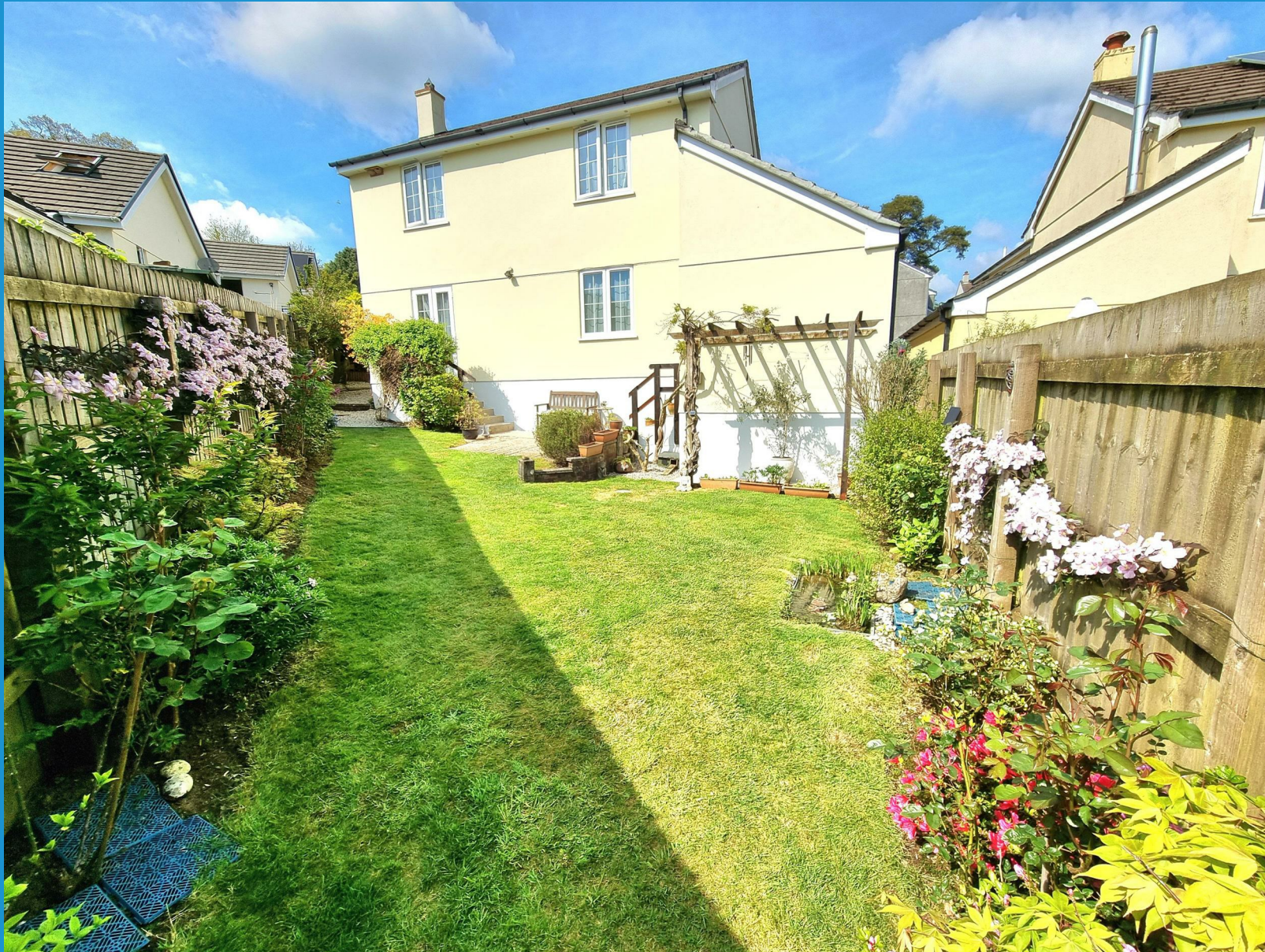
Serpells Meadow Polyphant | Launceston