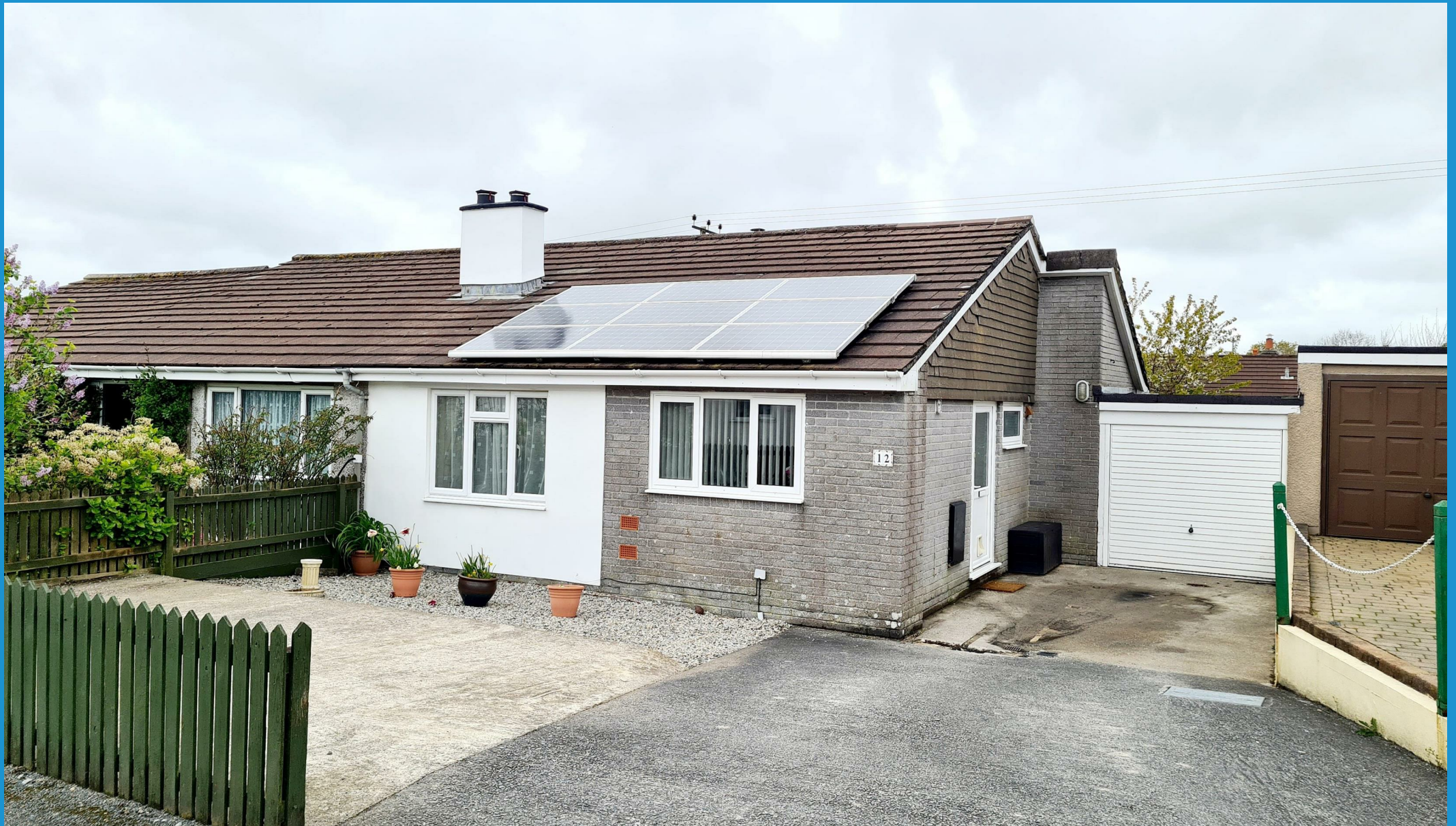
Tor View Tregadillett | Launceston