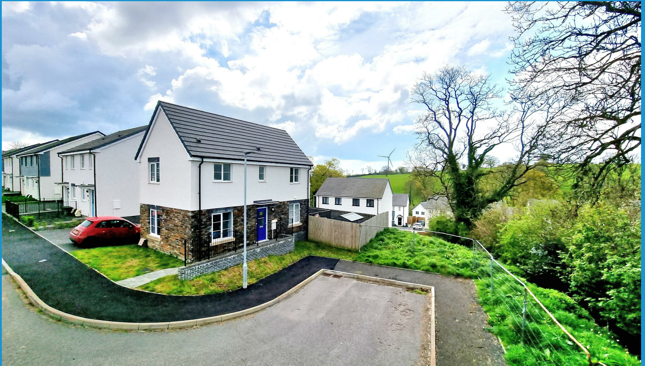
Barley Rise Launceston | Cornwall