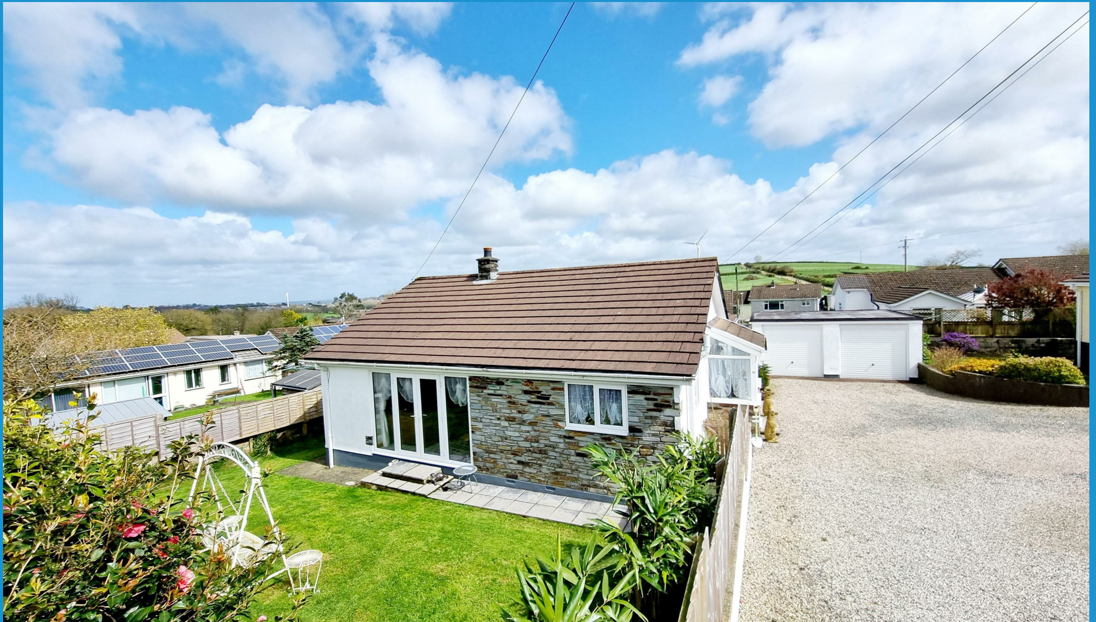
Tiny Meadows South Petherwin | Launceston