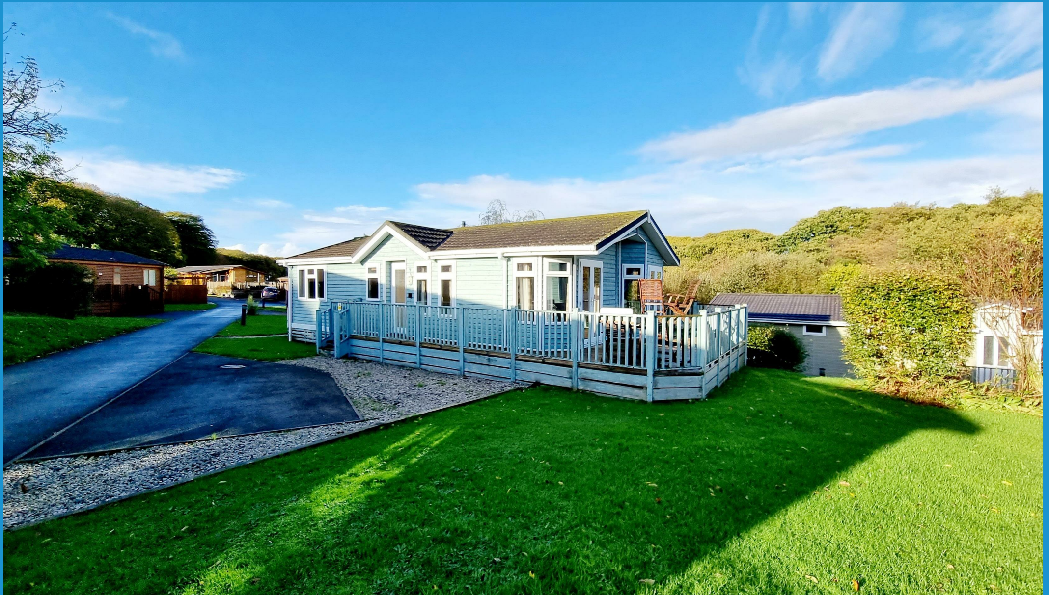
Lodge 8 Willow Bay Country Park Whitstone | Cornwall