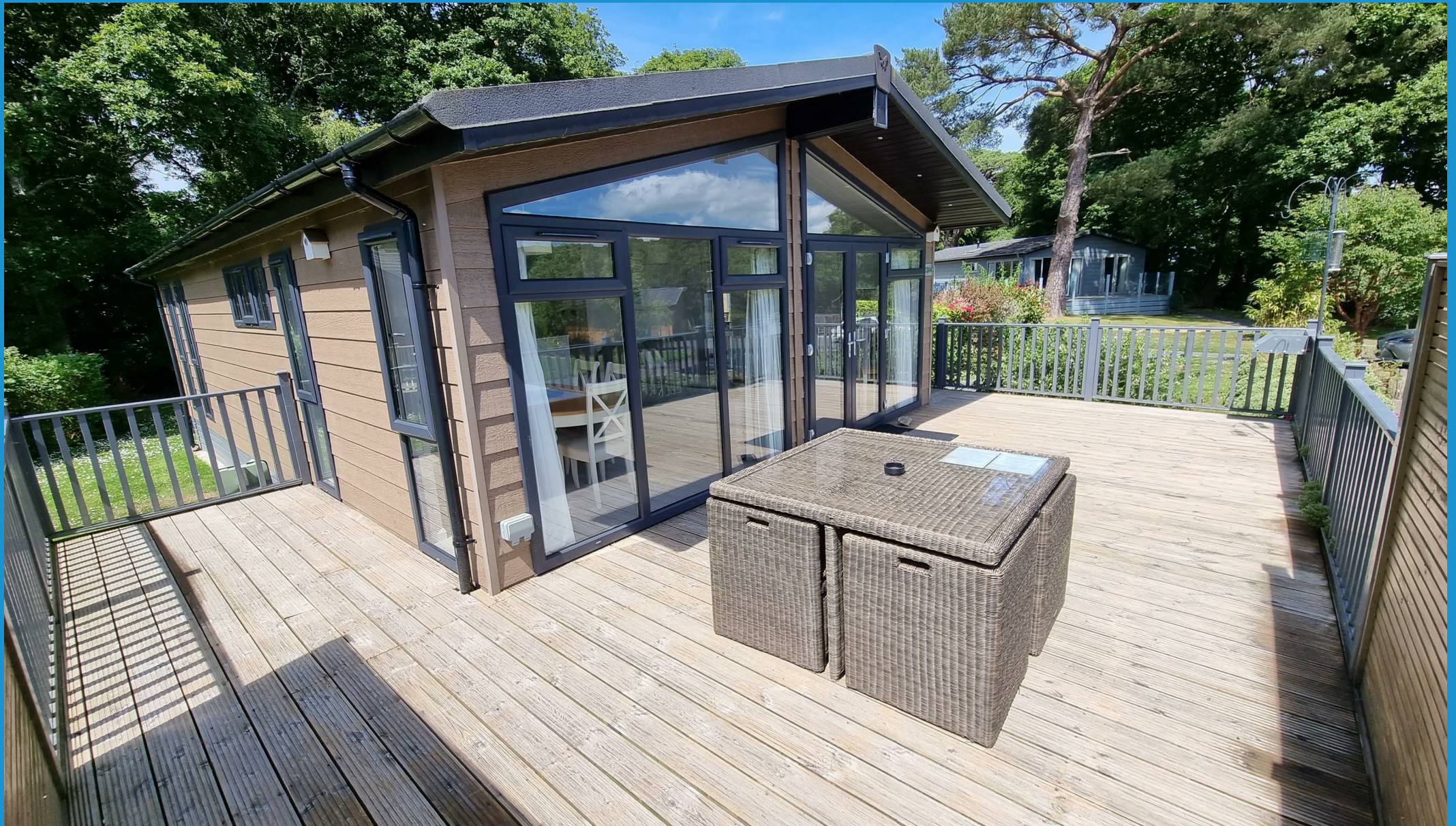
Willow Bay Country Park Whitstone | Cornwall