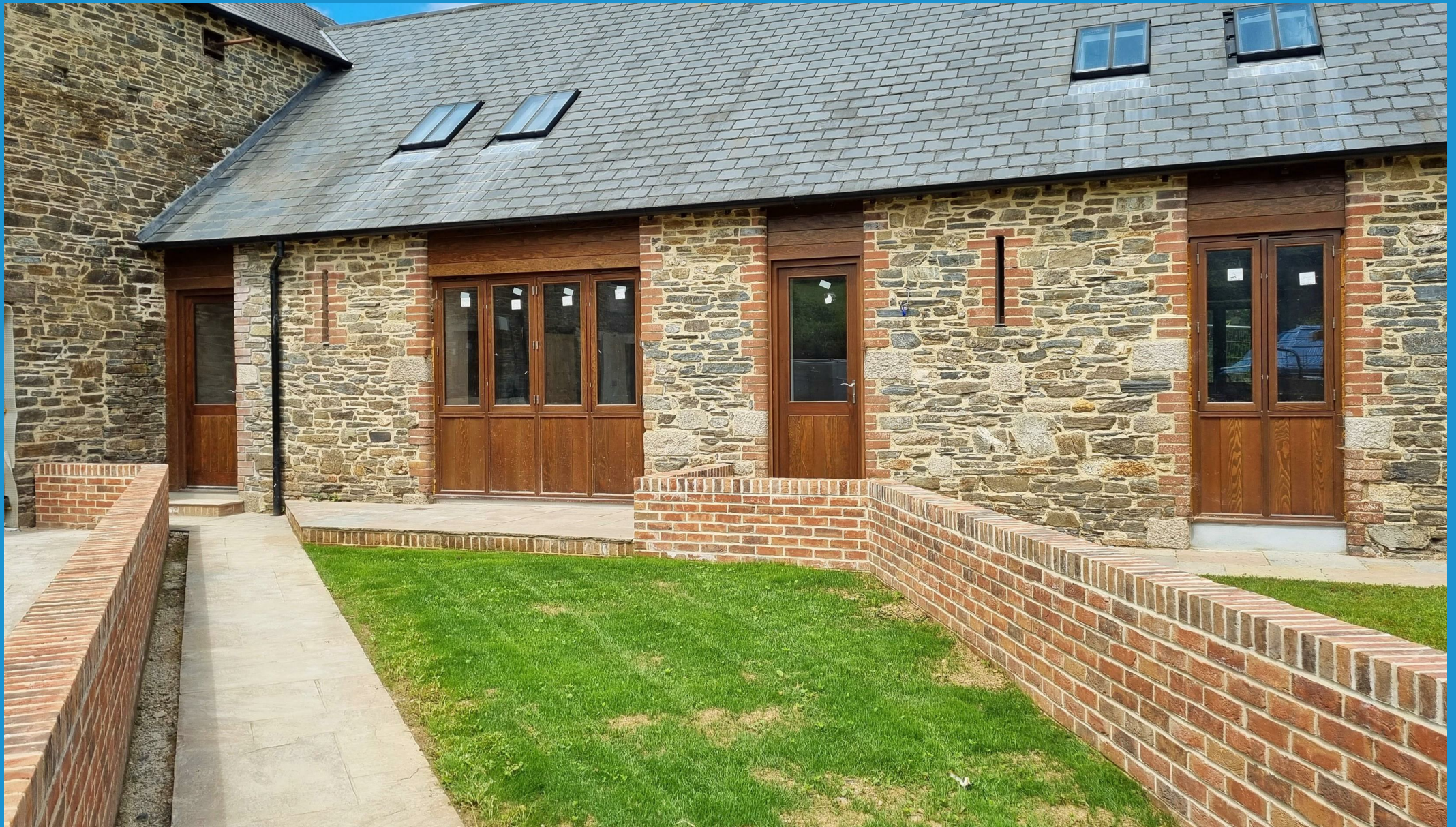
Penscombe Barns Lezant | Launceston | Cornwall