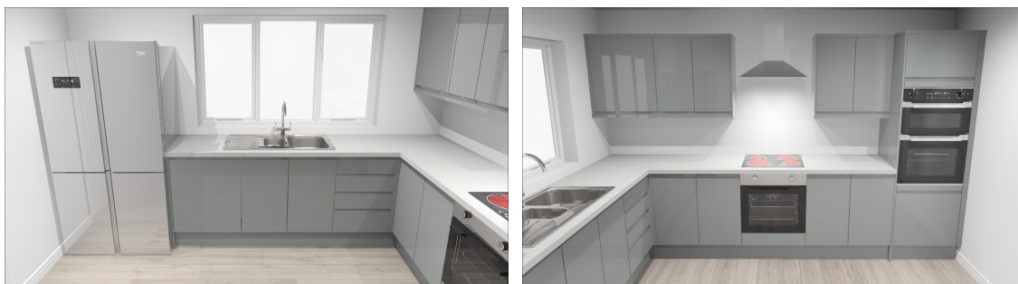
Proposed kitchen layout

Help-to-buy-wales-buyers-guide-phase-3-extension_0.pdf