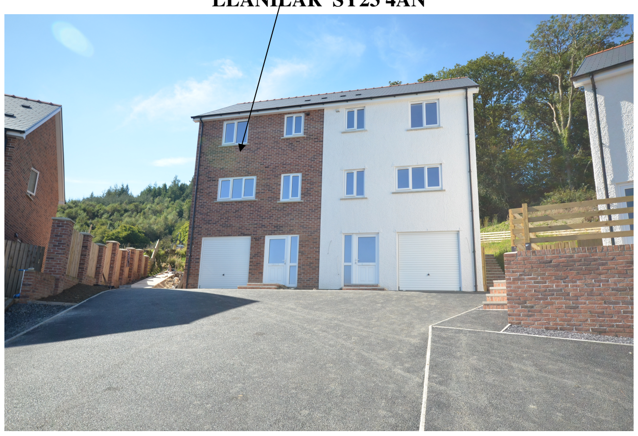
HELP TO BUY SCHEME £269,000

1 Chalybeate Street, Aberystwyth, Ceredigion. SY23 1HS