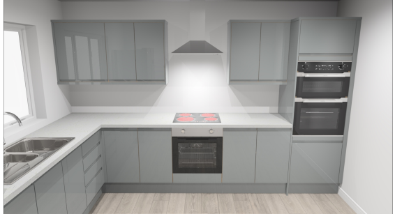
Proposed kitchen layout