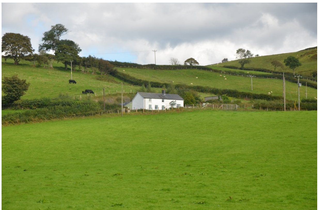
PENRHIW TALYBONT SY24 5HJ

<u>Vendor Likes:</u> Hilltop side location Sea view from upper paddock Sunny position Annex