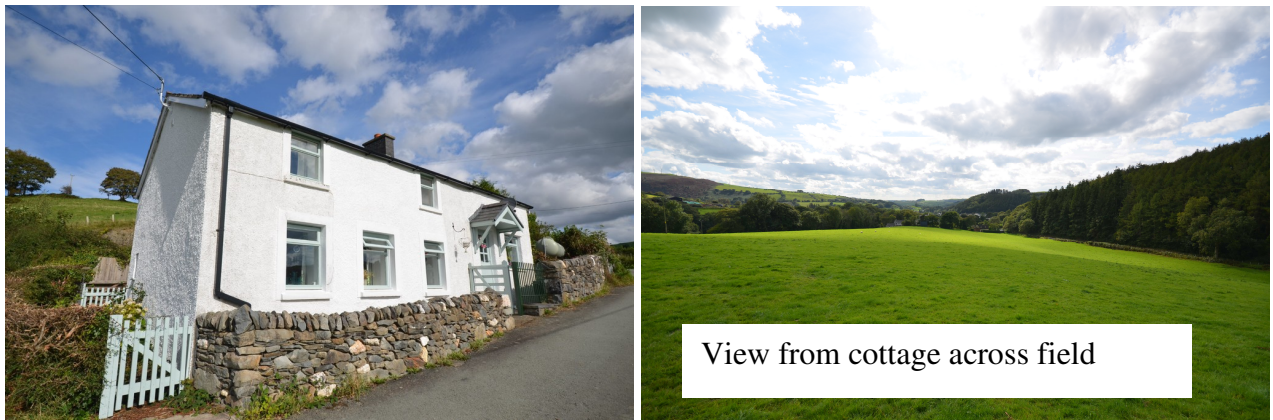
Vehicular access via twin timber gates to rear hardstanding parking and turning area in front of:

The front of the cottage has wonderful views for miles down the valley. The front bridleway is neatly divided from the cottage via a low level stonewall, fence and foot gate to concrete flagged paved area