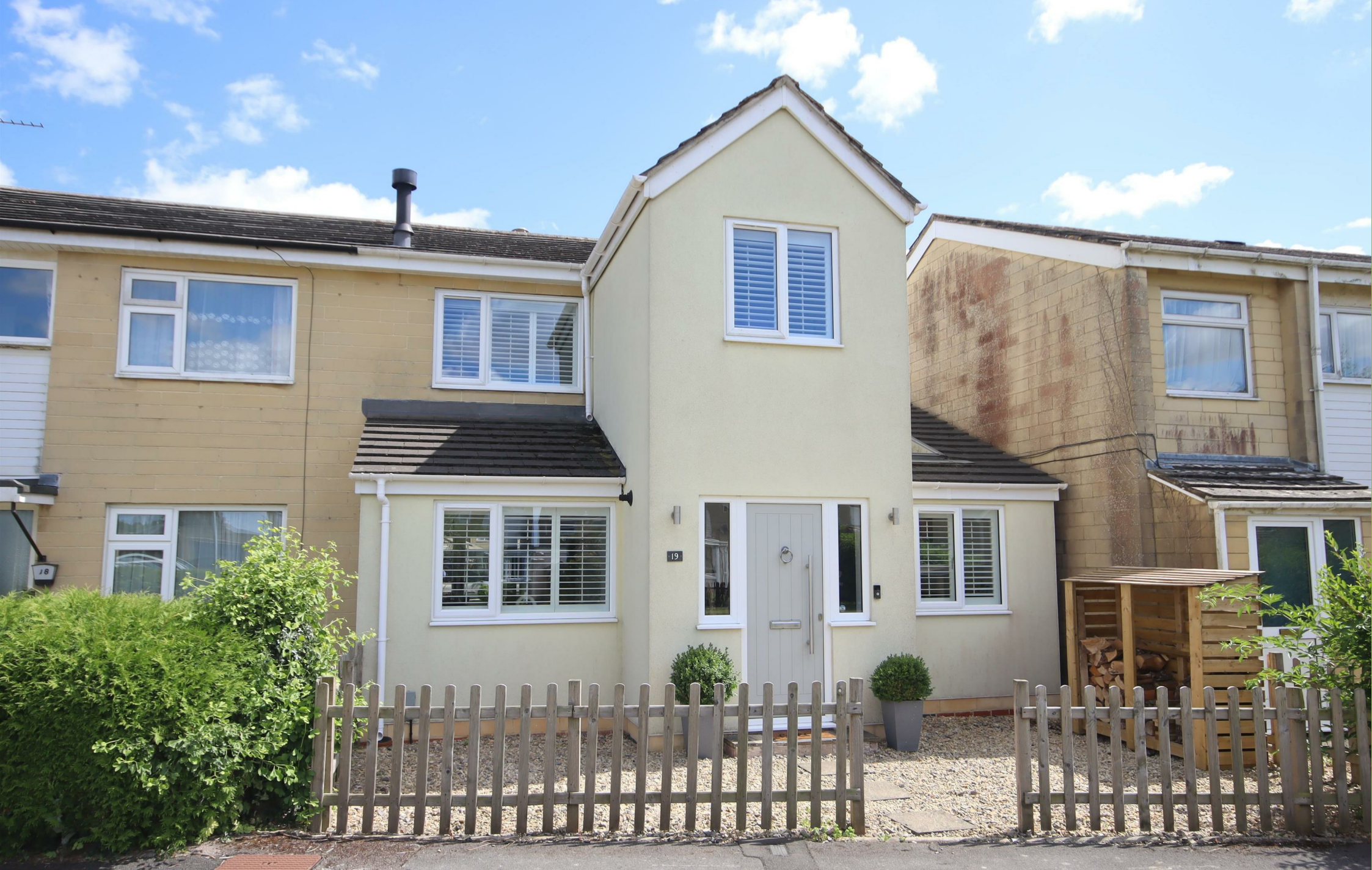
19 Forrester Green Chippenham