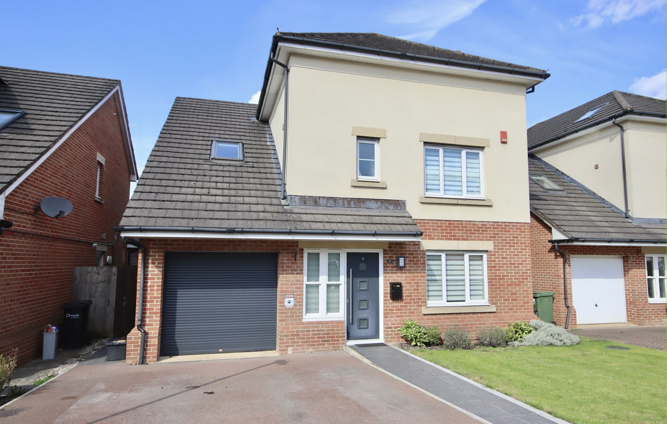
2 Wren Court Calne