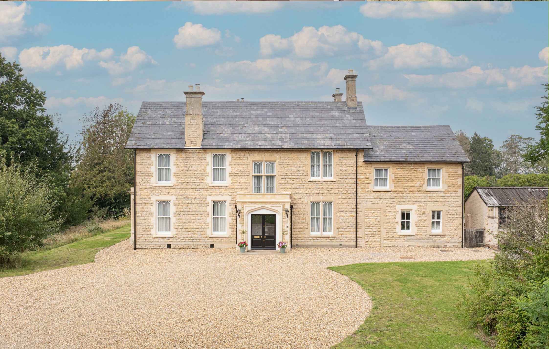
Chilvester Hill House Calne