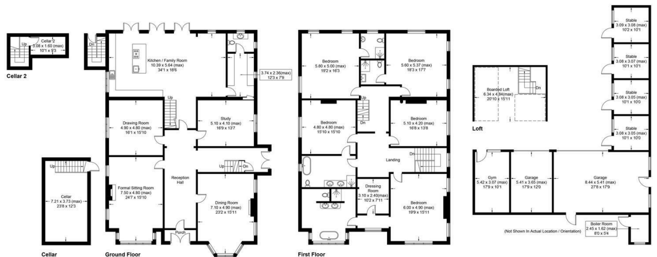
Illustration for identification purposes only, measurements are approximate, not to scale. (ID1129262)