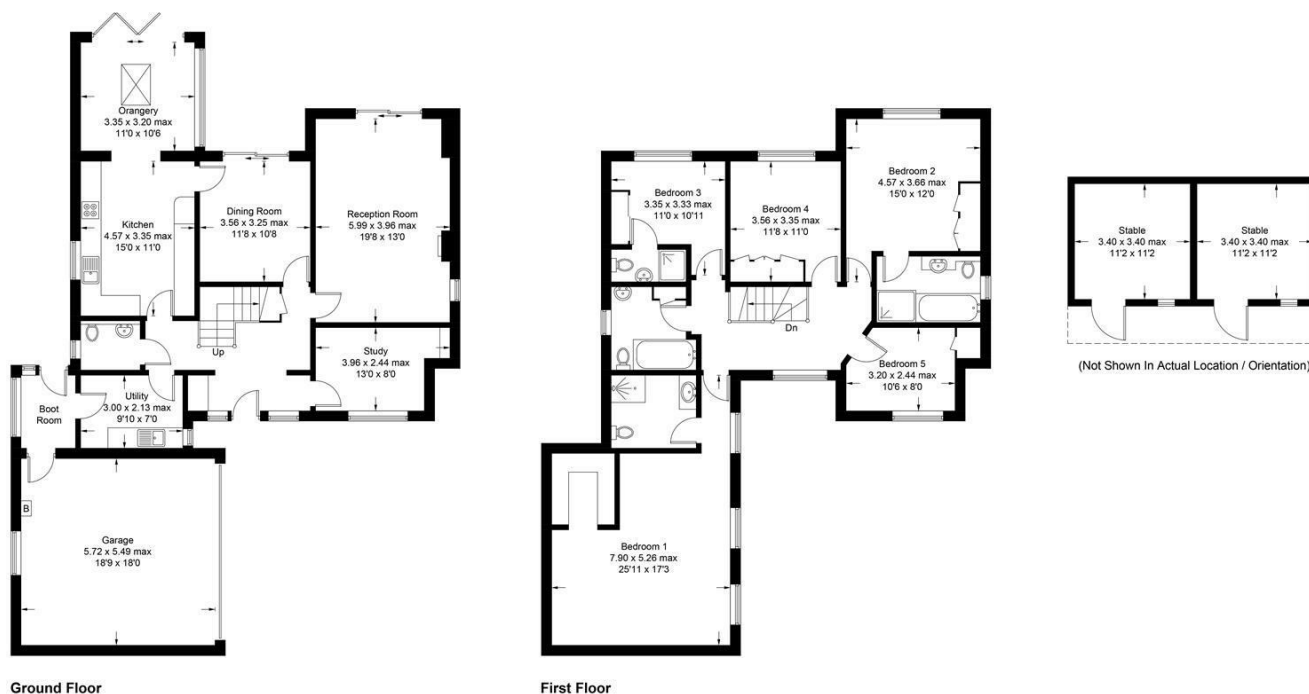
Illustration for identification purposes only, measurements are approximate, not to scale. (ID1068907)