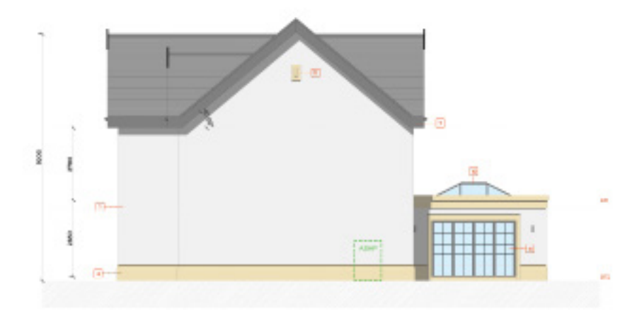
Proposed Side Elevation 1 (South-eastern)