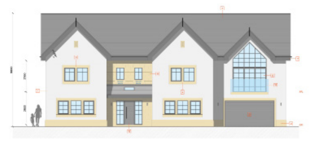
Proposed Front Elevation (South-western)

Every care has been taken with the preparation of these property details but they are for general guidance only and complete accuracy cannot be guaranteed. If there is any point, which is of particular importance professional verification should be sought. These property details do not constitute a contract or part of a contract. We are not qualified to verify tenure of property. Prospective purchasers should seek clarification from their solicitor or verify the tenure of this property for themselves by visiting www.landregisteronline.gov.uk. The mention of any appliances, fixtures or fittings does not imply they are in working order. Photographs are reproduced for general information and it cannot be inferred that any item shown is included in the sale. All dimensions are approximate.