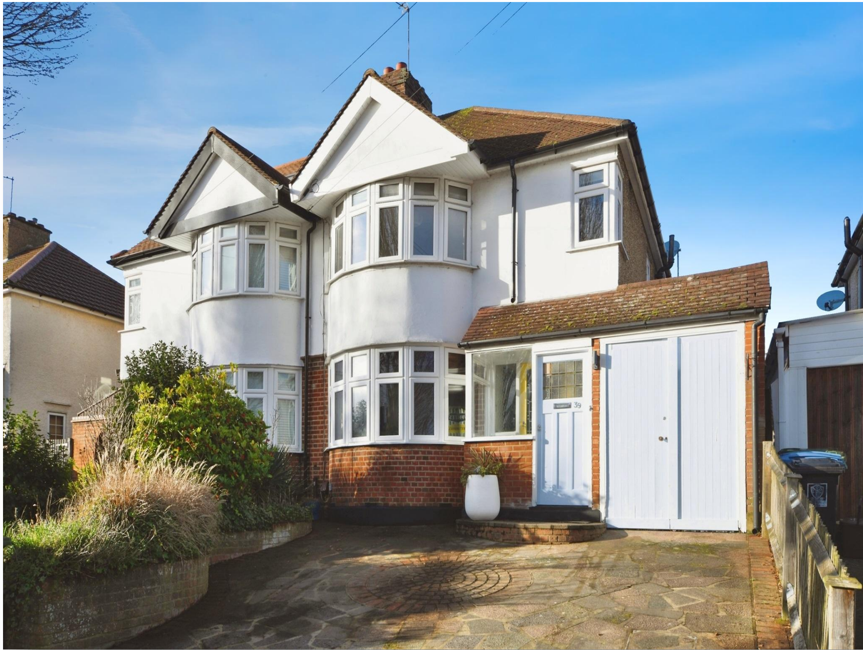
Hillrise Avenue, Watford, WD24 7NP