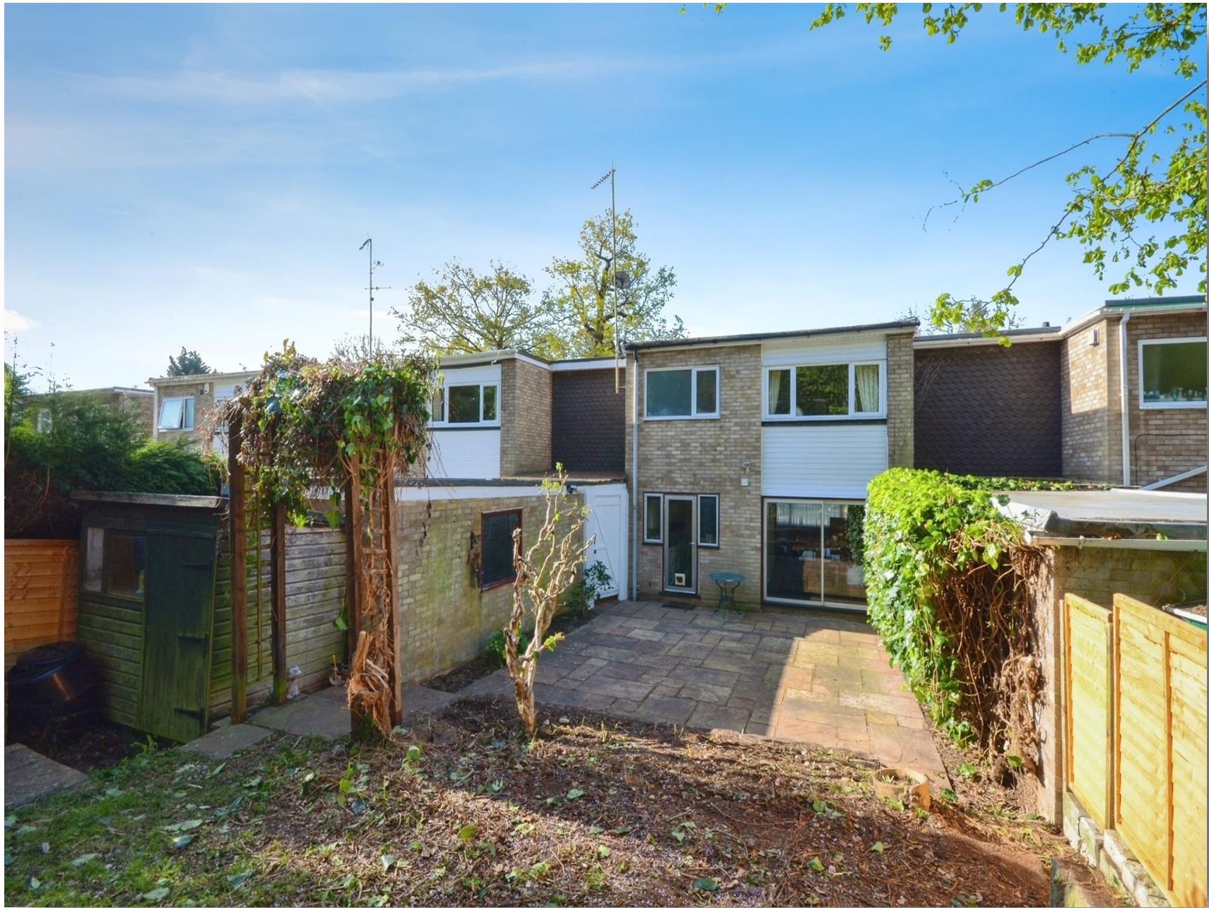
By The Wood, Watford WD19 5AG