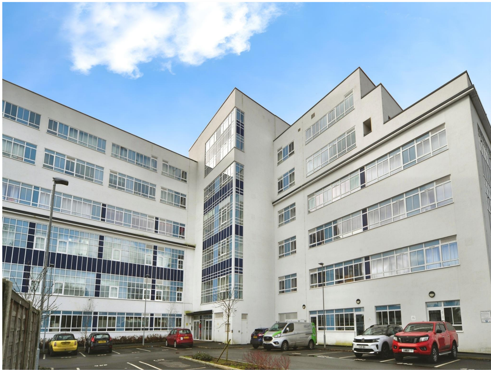
Yeatman Court, Cherry Tree Road, Watford, WD24 6AF