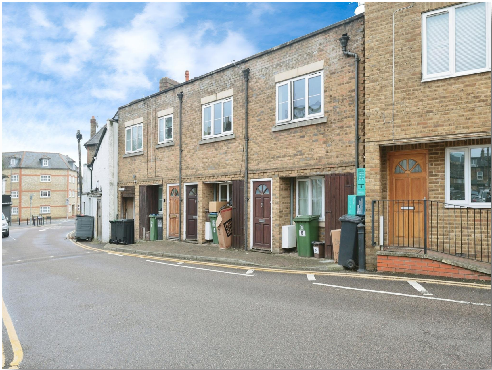
Loates Lane, Watford, WD17 2AB