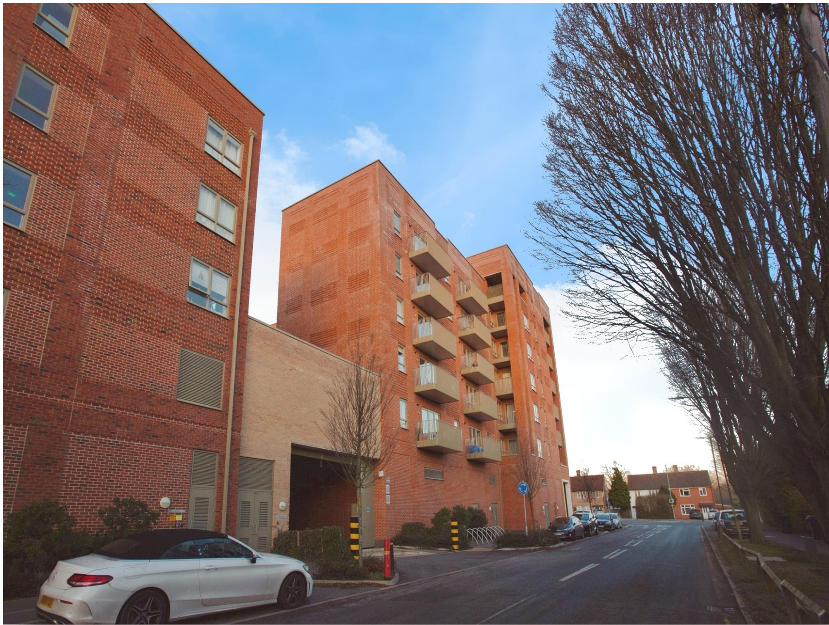
Nightingale House, Oxhey Drive, Watford, WD19 7FH