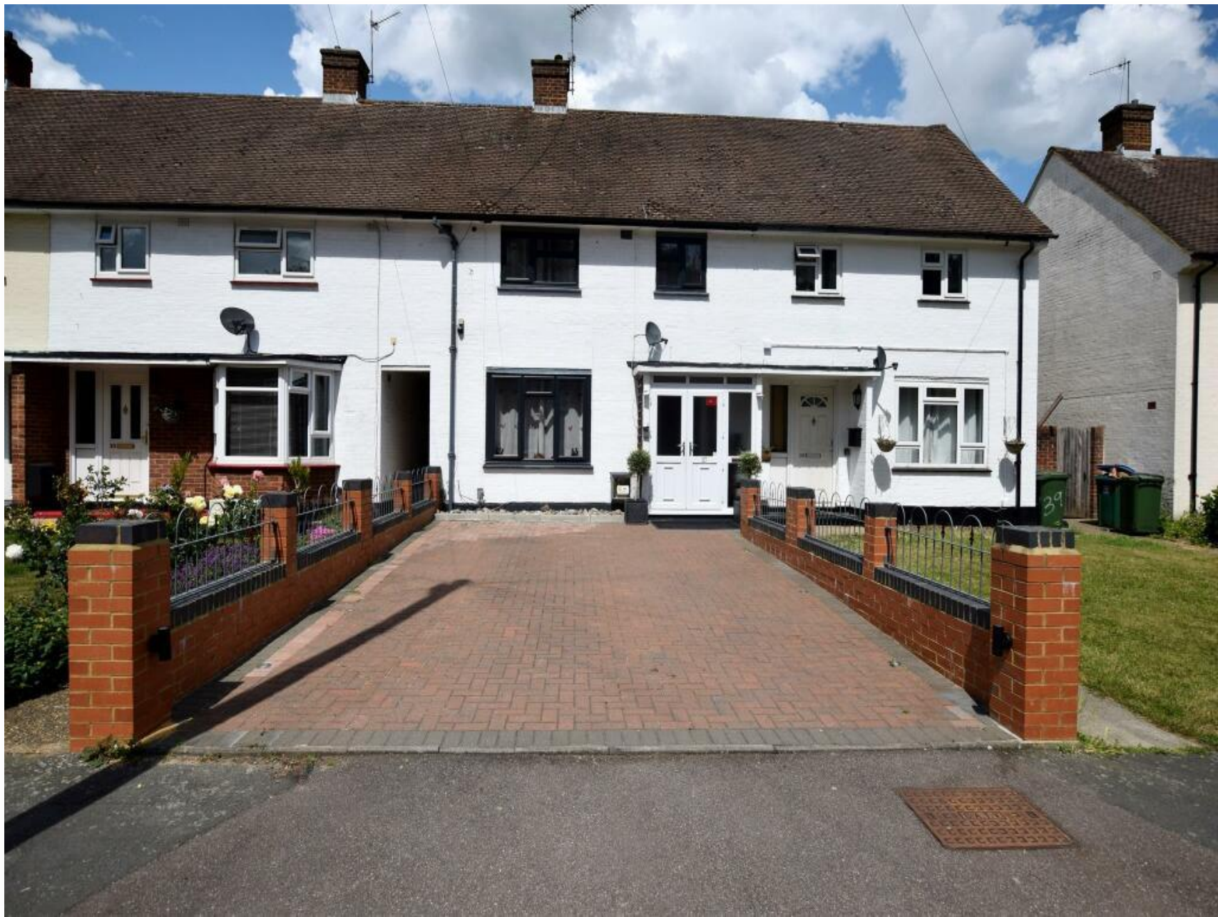
Valley Rise, Watford, WD25 7EY