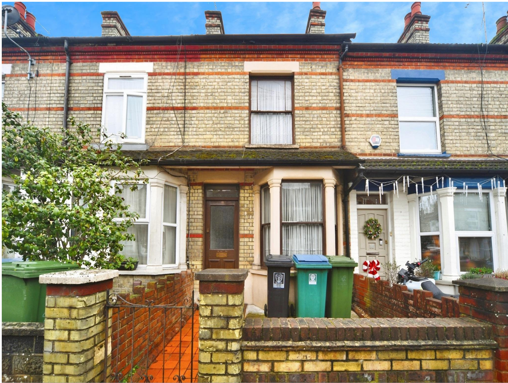
St. Marys Road, Watford, WD18 0EF