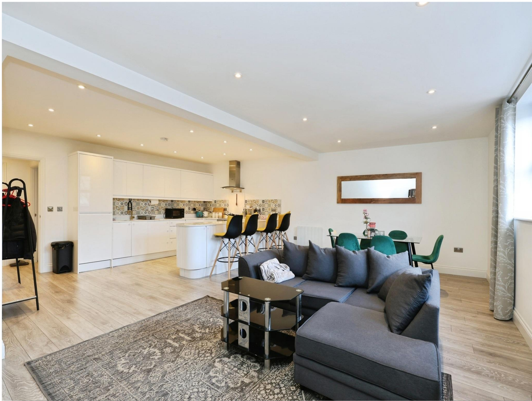
Cedar House, The Parade, Watford, WD17 1LQ