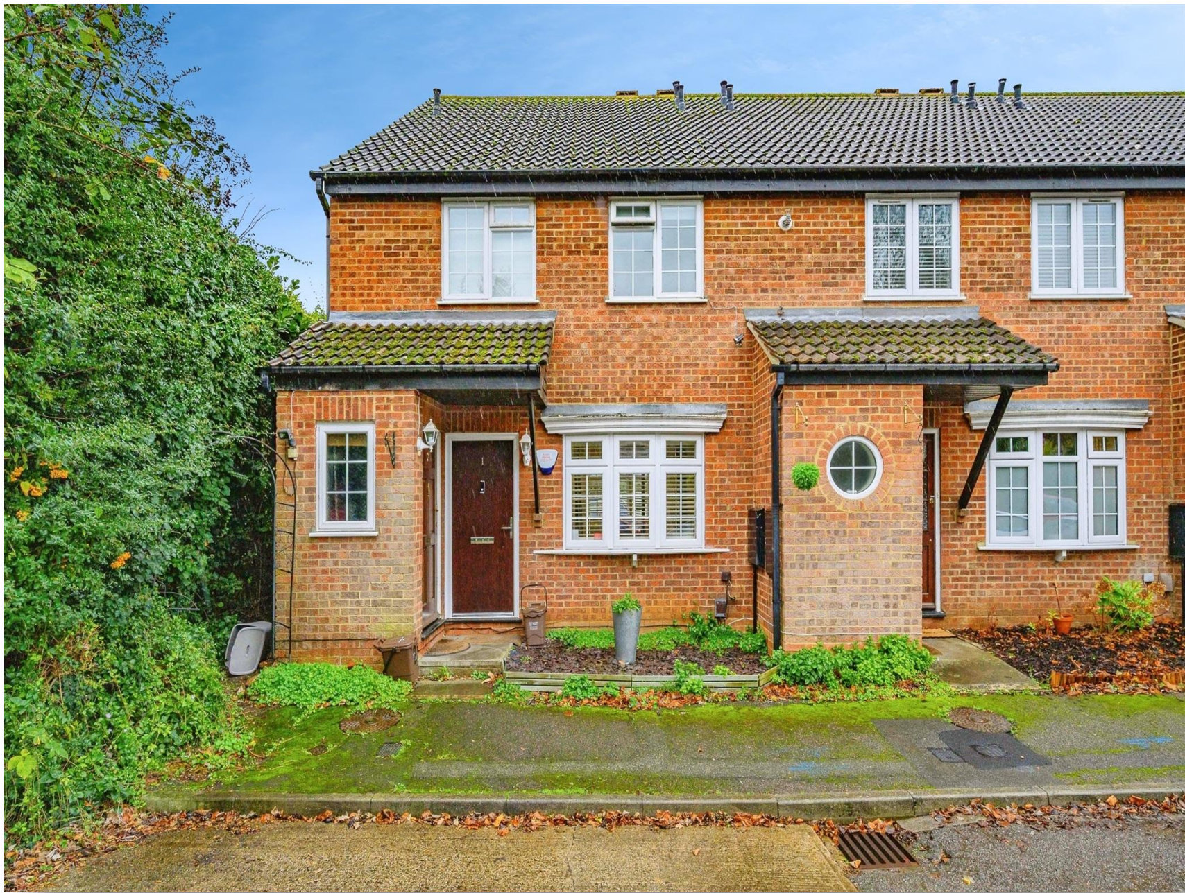
Harding Close, Watford, WD25 7PE