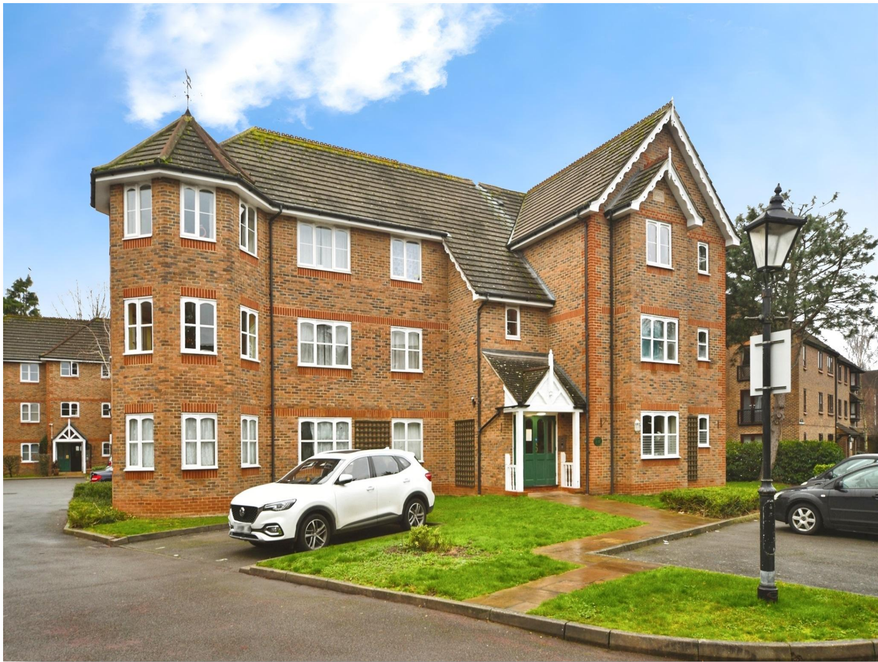
The Beeches, Watford, WD18 0JW