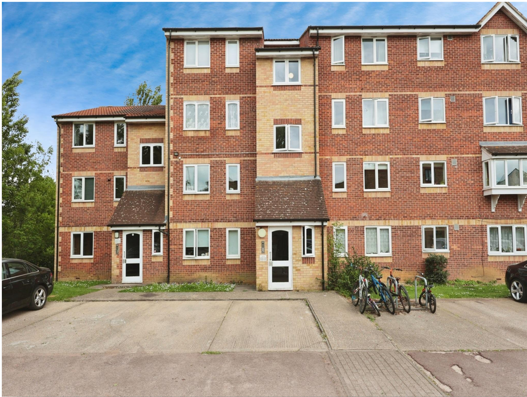
Guernsey House, Pioneer Way, Watford, WD18 6ST